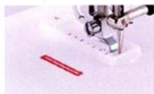
4-STEP AUTOMATIC BUTTONHOLER